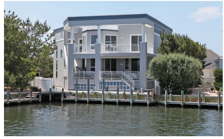
LAGOONFRONT - HARVEY CEDARS

High volume reverse living contemporary with great architectural flair desirably located in Harvey Cedars High Point neighborhood. 4 bedrooms, 3 full baths, huge family room with hardwood floors, large great room with fireplace and hardwood floors, wet bar, very spacious kitchen, multiple decks including easy access roof top deck with bay and sunset views, covered porch, dramatic three story entry foyer, tile and marble flooring, wet bar, 41.75 feet of bulkheaded lagoon frontage, very close to the open bay, and views spanning down the lagoon. Site orientation captures prevailing breezes and sunlight.